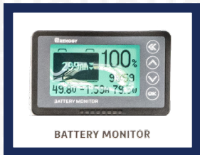
1. Renogy Battery Management Display