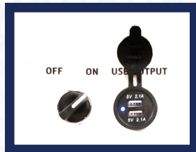
3. 1 x 5V USB-A 1 x USB-C outlets