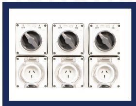
2. 3 x 15A Outlets