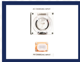
4. AC and PV Charging Inputs